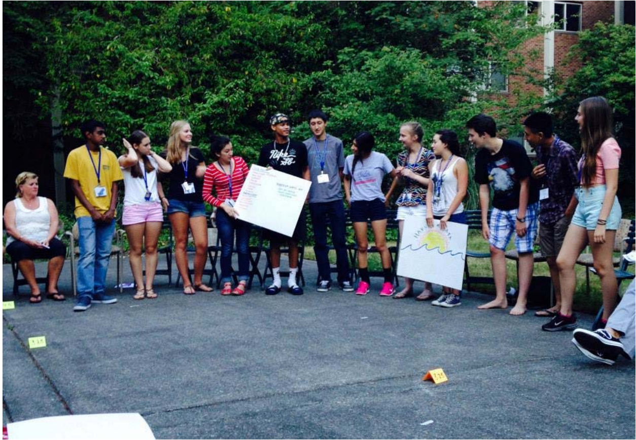
Quadrant I – The Supportives