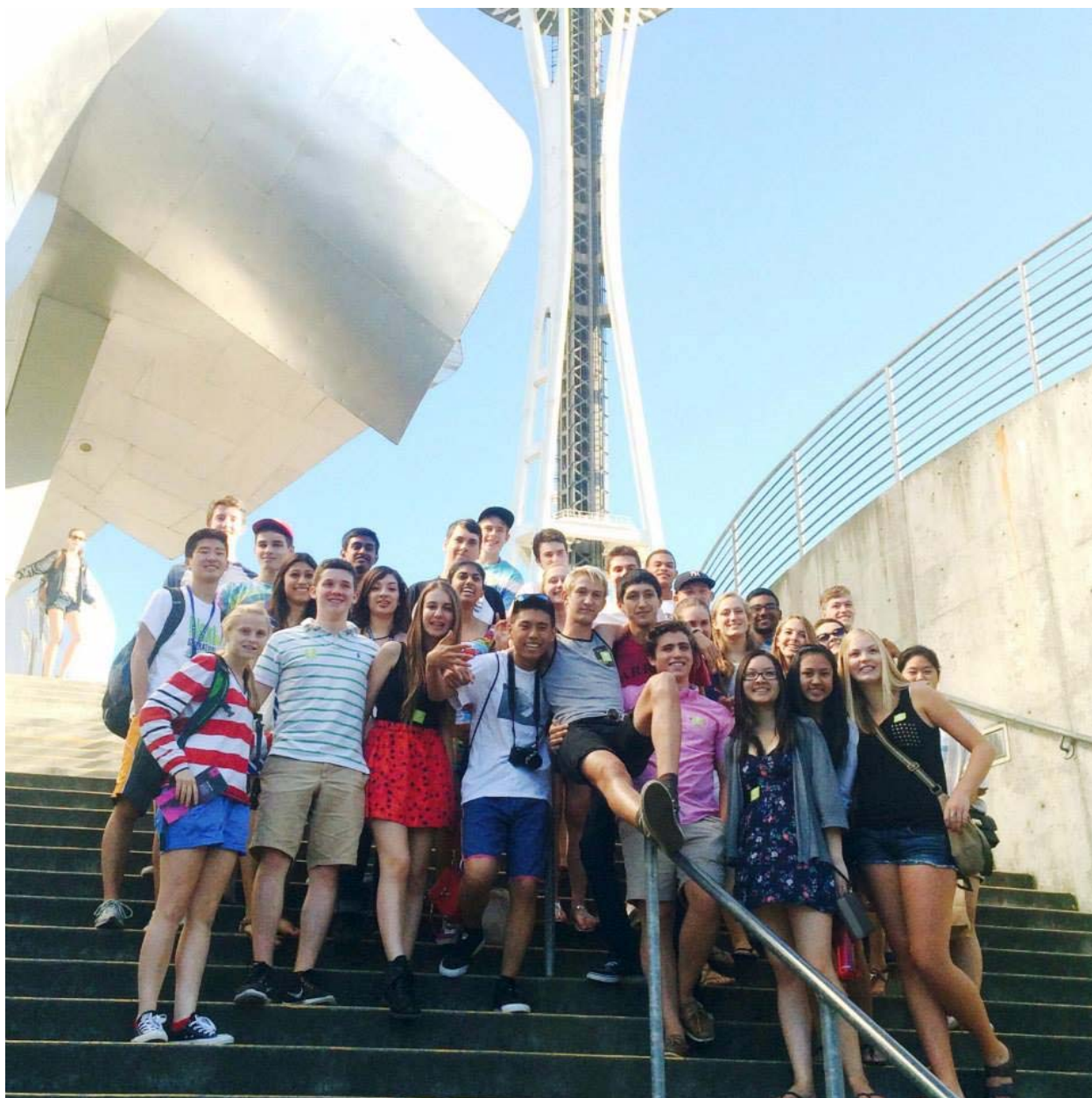
Here is a photo of all 33 of us students from our outing to the EMP museum. The museum was so much fun!