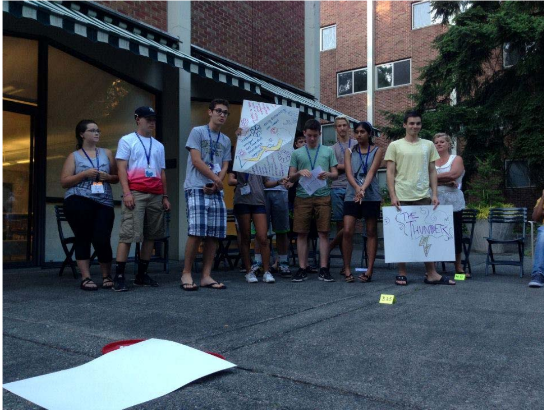
Quadrant II – The Expressives

Near the end of the week, all students and a few teachers took FTE's behavioral styles assessment. We then created visuals within our groups to help capture the essence of our quadrant. This exercise did help us identify our strengths and weaknesses, but it more importantly helped us recognize how everyone works differently within a group.