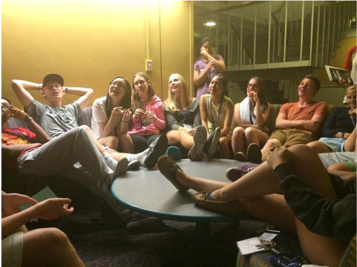
Bonding joke sessions