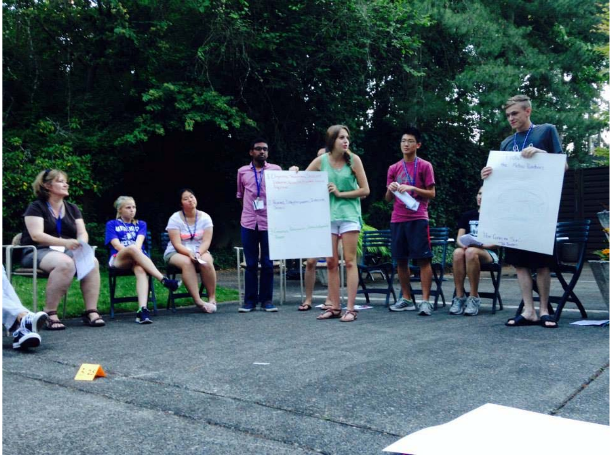
Quadrant IV – The Analyticals