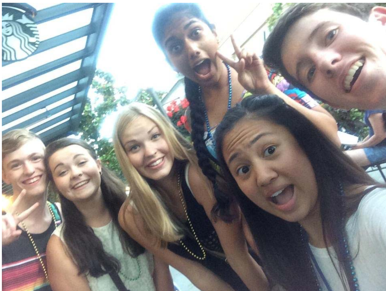
Dance crew! – at a local concert in University Village after our outing to the EMP museum