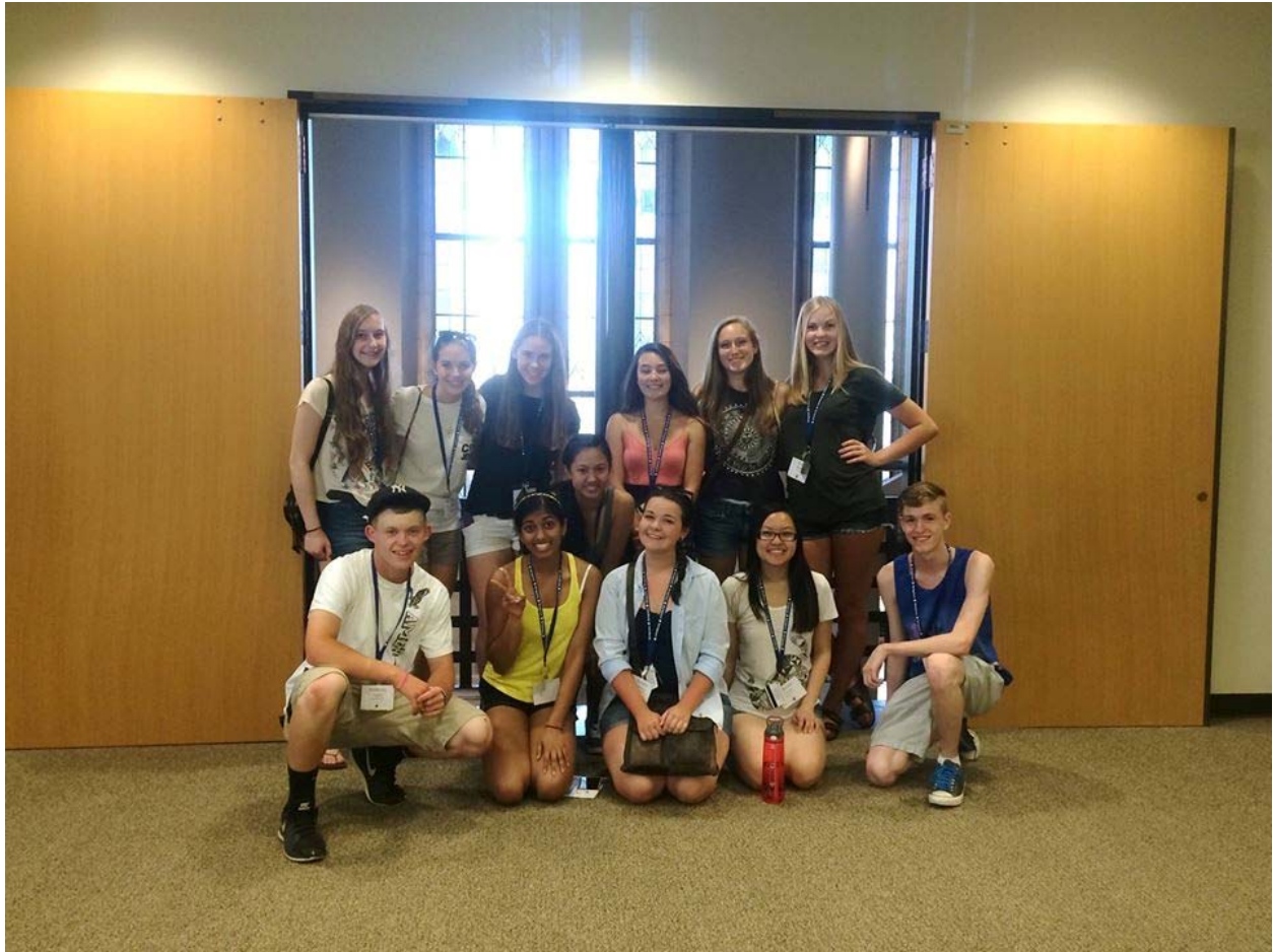
Small group adventures in the university library!