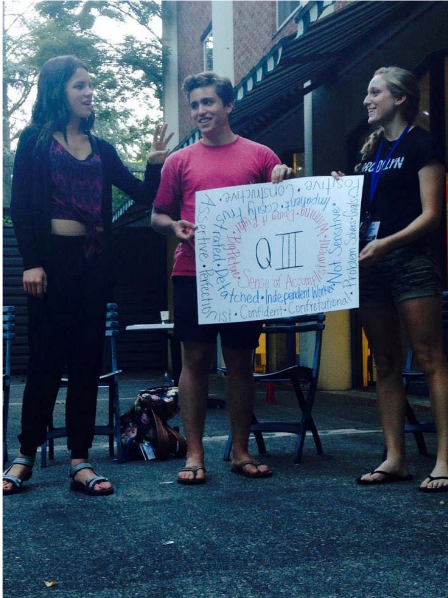
Quadrant III – The Drivers